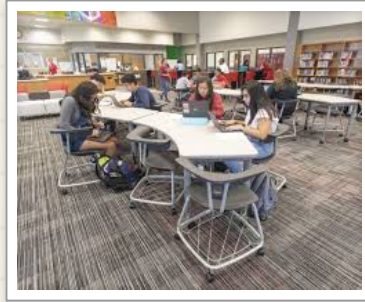
STUDENTS ON THE NEW WIRELESS NETWORK