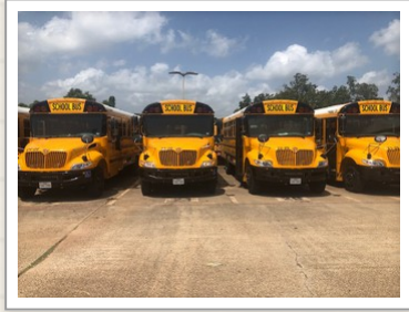
NEW BISD BUSES