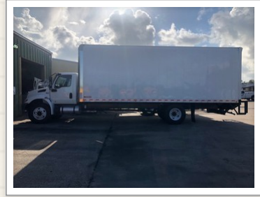
NEW BISD BOX TRUCK